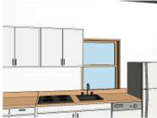
② Walkthrough 5