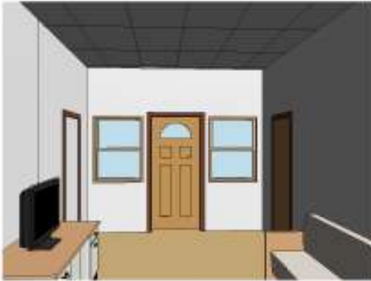
① Walkthrough 4